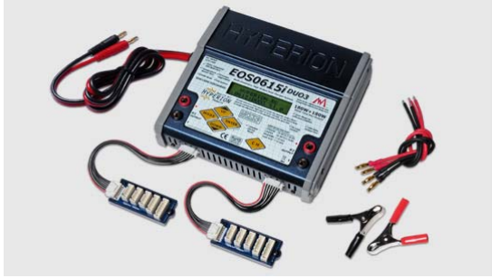
USB Cable also included but not pictured

v3.2 Firmware version. Visit http://media.hyperion.hk/dn/eos for the newest manuals, firmware, and software