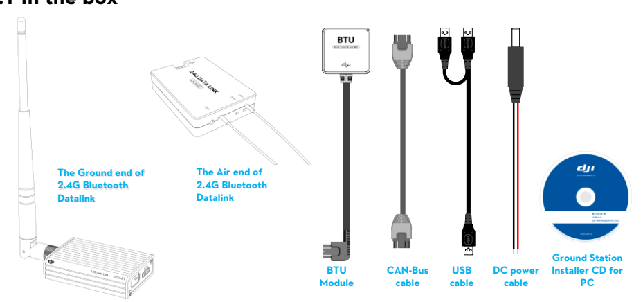
Important: the firmware of BTU should be upgraded to version 1.0.1.2 or above to use with the 2.4G Bluetooth Datalink.